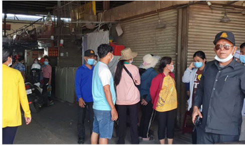
The protesters who gathered to protest the unfair treatment.

Click here to get Khmer Times Breaking News direct into your Telegram