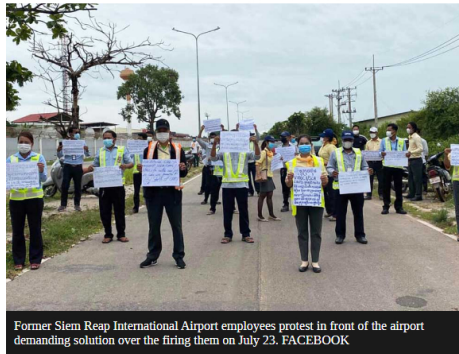
Former Siem Reap International Airport employees protest in front of the airport demanding solution over the firing them on July 23.

Thirty out of 131 former Siem Reap International Airport employees have resumed their demand for compensation after being laid off in November last year. However, provincial labour officials said the demands exceeded what was required by law.