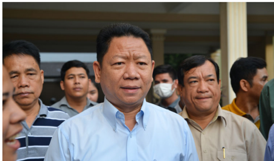
City Hall offers compensation to former Cintri staff to end protest.

Click here to get Khmer Times Breaking News direct into your Telegram