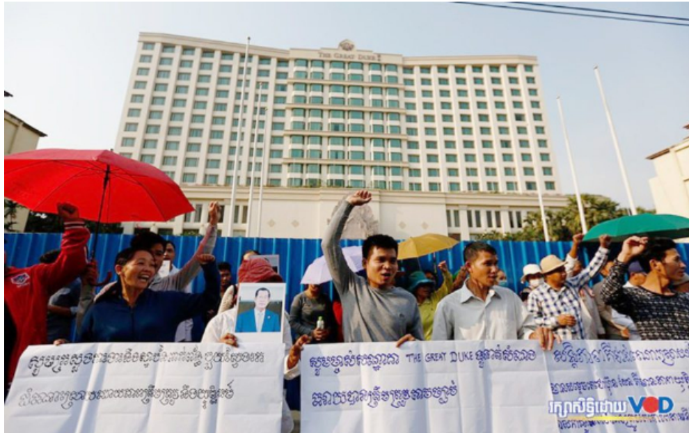
Former employees of the closed-down Great Duke Hotel raise banners demanding severance pay and benefits on January 20, 2020 in Phnom Penh.

[responsivevoice_button voice="US English Female"]