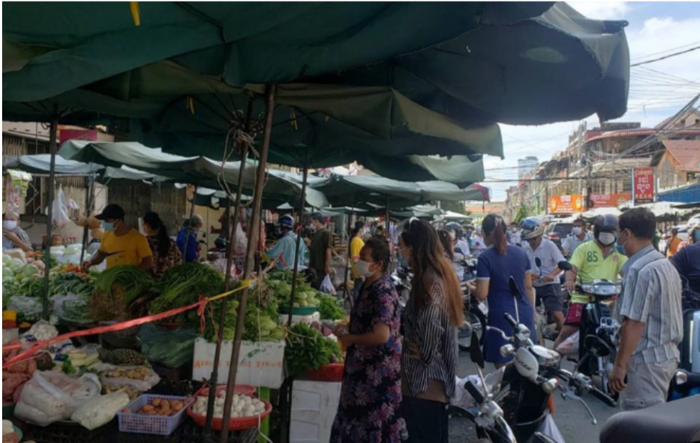
Shoppers crowd a street market near Phnom Penh's Olympic Market ahead of a two-week citywide market shutdown on April 24, 2021.

[responsivevoice_button voice="US English Female"]