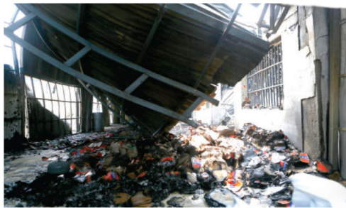
Fire destroys a mattress warehouse in Phnom Penh's Por Senchey district yesterday.

Click here to get Khmer Times Breaking News direct into your Telegram