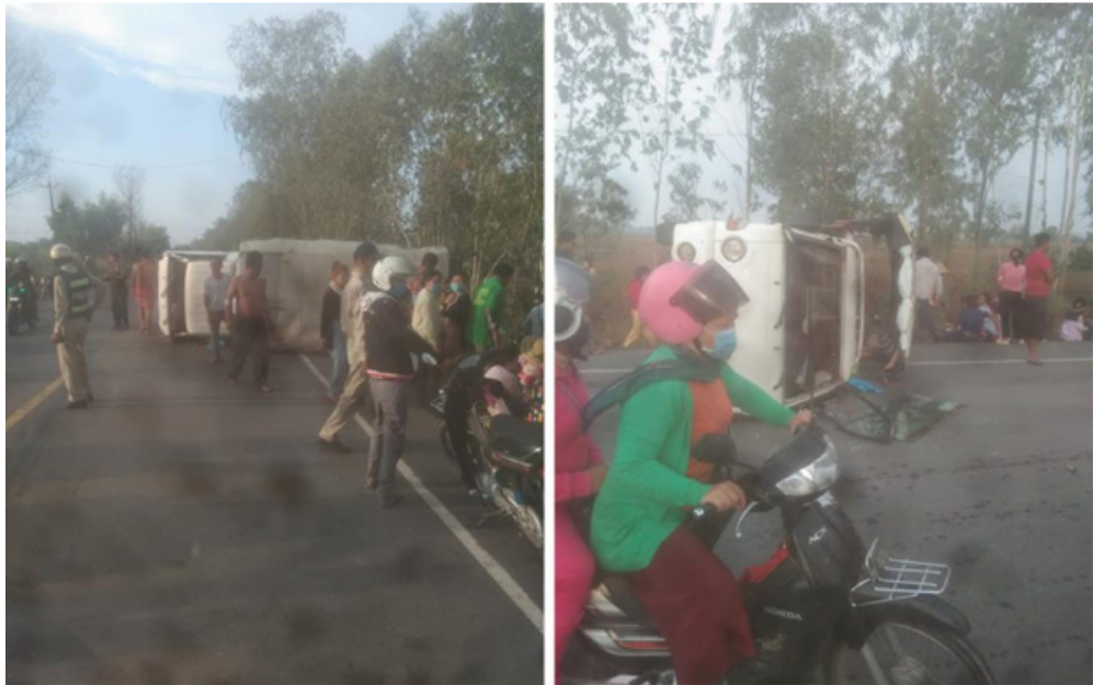
The scene of a truck crash in which 33 garment workers were injured in Takeo province's Traing district on April 15, 2020, in this photograph posted to the Vanna News Takeo Facebook page.

[responsivevoice_button voice="US English Female"]