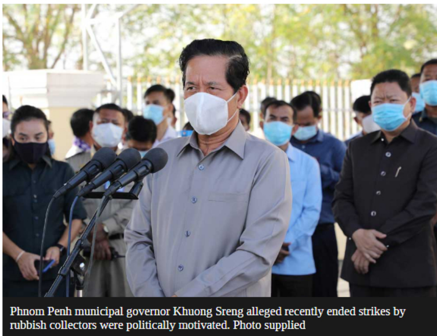
Phnom Penh municipal governor Khuong Sreng alleged recently ended strikes by rubbish collectors were politically motivated.