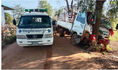
A truck carrying garment workers hit a tree in Kampong Speu province.

Click here to get Khmer Times Breaking News direct into your Telegram