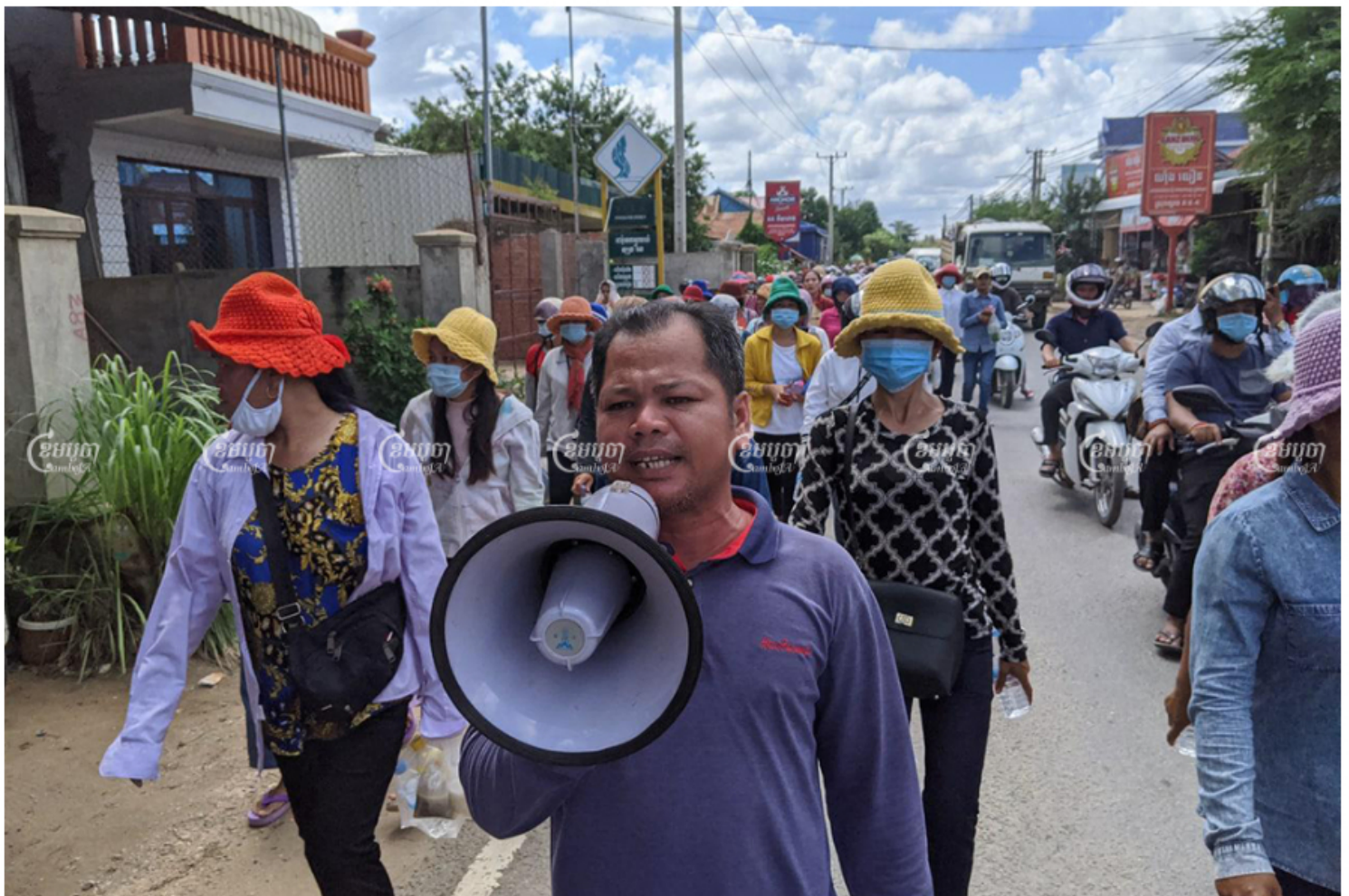
200 workers marched to the Kandal Provincial Court in Takhmao City on July 13 to submit a petition asking that the court remove an injunction preventing them from being paid by their former factory owner. Panha Chhorpoan