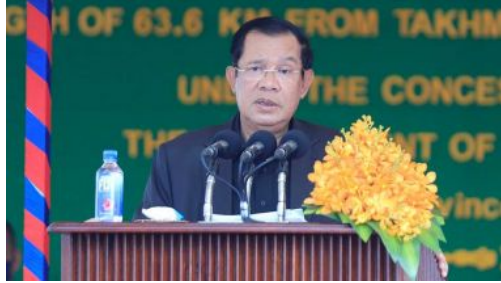
PM: Kingdom against forceful invasion

This is a dangerous moment for freedom-loving people around the globe. By launching his brutal assault on the people of Ukraine, Russian President Vladimir Putin has also committed an assault on the principles that uphold global peace and territorial integrity. The people of Ukraine are