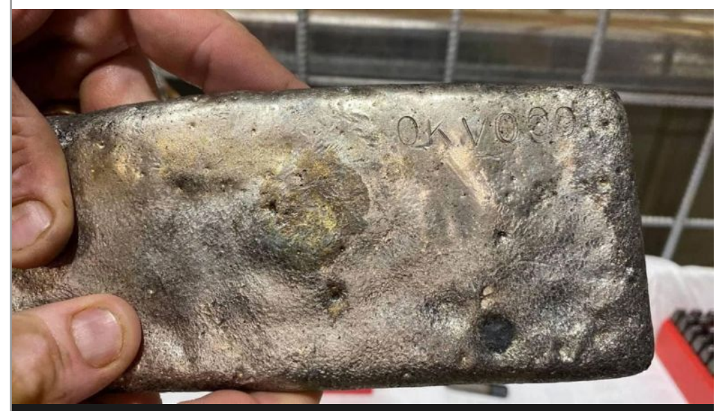
The Okvau Gold Project, the Kingdom's first commercial gold mine, went online on Monday.

An earlier report outlined an initial Life of Mine (LOM) of eight years, with an average of three tonnes of gold produced each year.