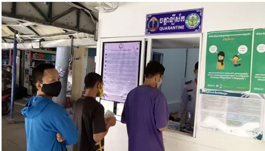
Migrant workers at the quarantine center.