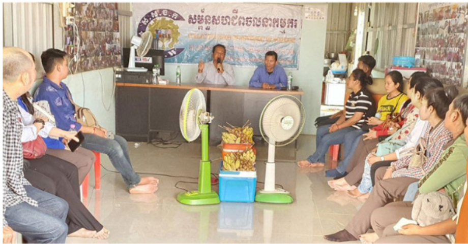
Unionists hold a meeting with the workers. UCUMW

According to a Labour Ministry directive, companies are required to pay seniority after the beginning of 2019.