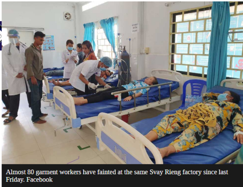
Almost 80 garment workers have fainted at the same Svay Rieng factory since last Friday.

Twenty-three garment workers at TY Electric Co Ltd in Svay Rieng province fainted on Monday after 49 others fainted on Friday and Saturday from tiredness and lacking vitamins.