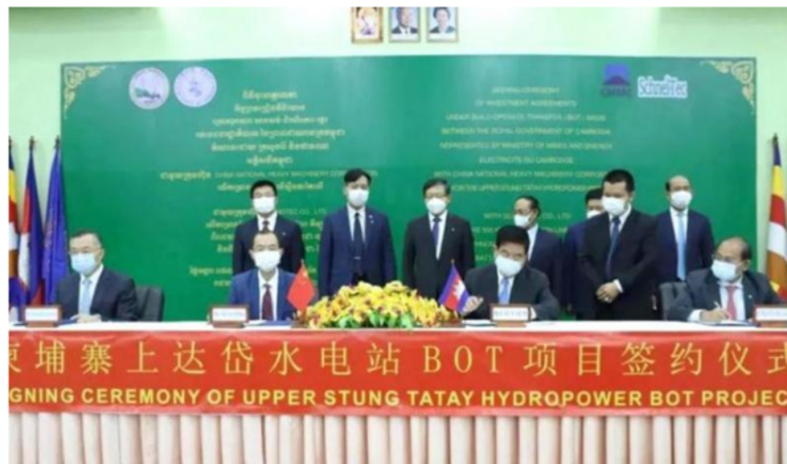
▲ SINOMACH signs its investment agreement for another Cambodian hydropower station.

SINOMACH China Heavy Machinery Co Ltd, the Ministry of Energy and Mines of Cambodia and the Cambodian National Electric Power Co formally signed an implementation agreement, lease agreement and power purchase agreement for the build-operate-transfer (BOT) investment project of the Shangddai Hydropower Station to utilise the cascade development of Cambodia's Dattay River Basin.