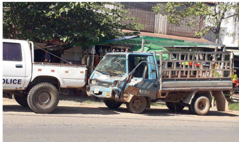
Archive photo. DAP News

Click here to get Khmer Times Breaking News direct into your Telegram