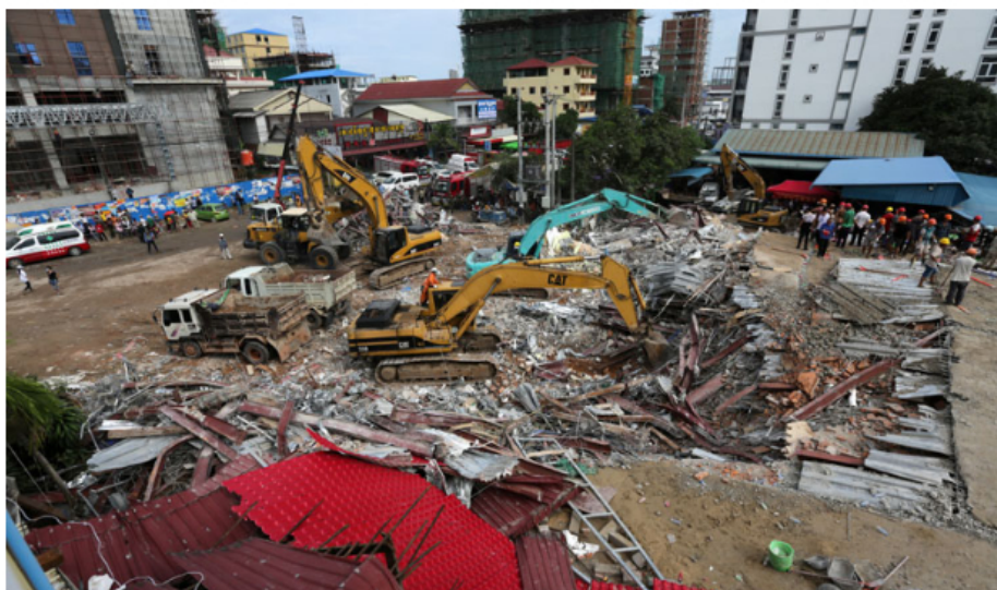
File photo of the seven-storey building collapse in Preah Sihanouk province's Sihanoukville in June 2019.