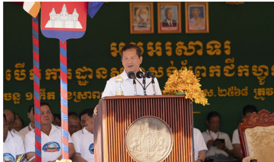
Prime Minister Hun Manet speaks at the launch of the Funan Techo Canal project in Kandal province yesterday.

Click here to get Khmer Times Breaking News direct into your Telegram