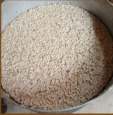
The rice is continued brewing for ten days.