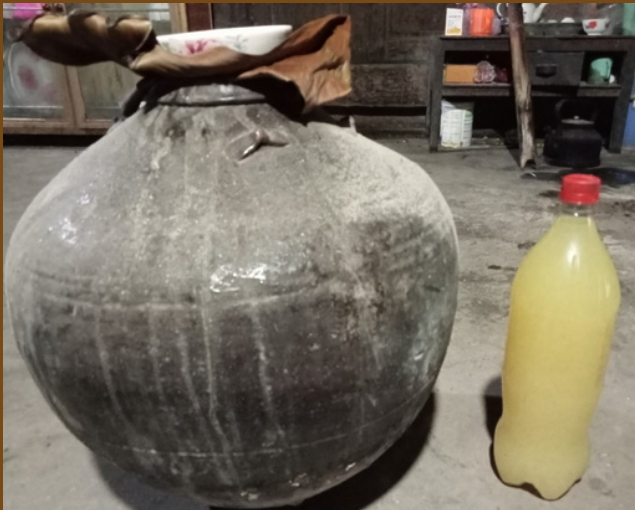
It takes about ten days to get "Hoang" wine from rice steaming. "Hoang" wine has an opaque yellow color, with a mixture of bitter and sweet taste and aromatic upland sticky rice. The wine has a very low alcohol content, so both men and women can enjoy it.