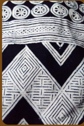
The fabric is then dyed in indigo and dipped in boiling water.