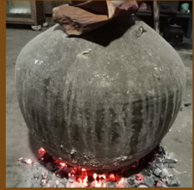
The wine liquid is then cooked in a jar until it boils thoroughly.