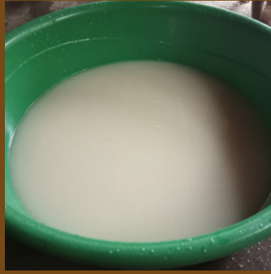
Wine liquid is then filtered out.