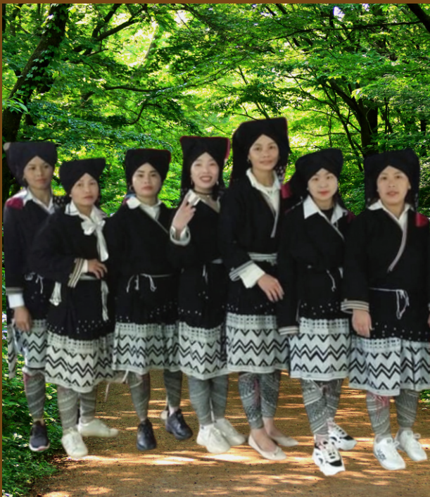
Women in Bai village in traditional costume.