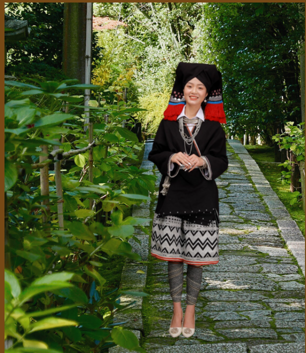
A Dao Tien bride wearing a skirt printed with beeswax.