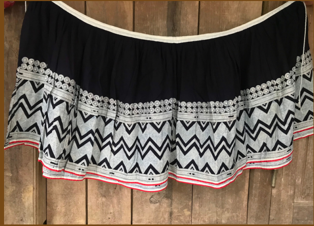
It takes up to 40 days to create a completed skirt. The process of printing beeswax takes seven days, dyeing indigo takes 30 days, and sewing and attaching red and white skirt edges takes three days.