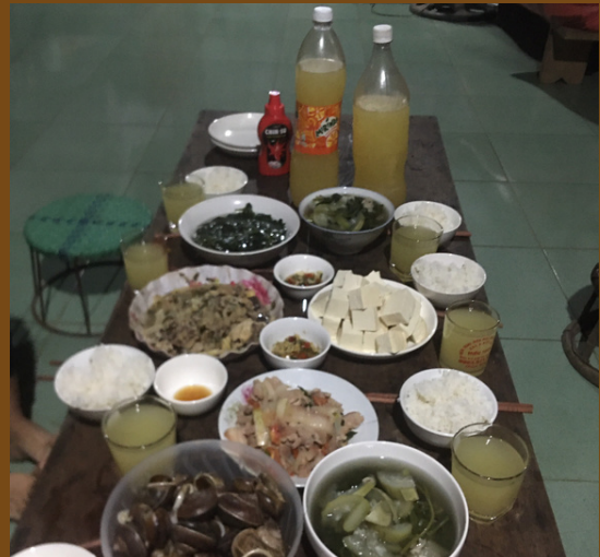
"Hoang" wine is an indispensable part of Dao people's tray of foods.