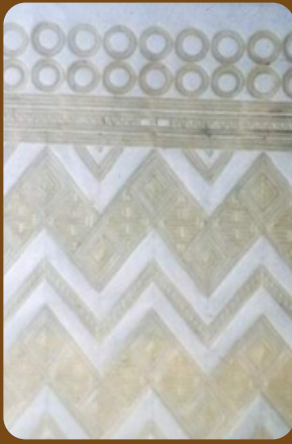
Piece of fabric after printing.