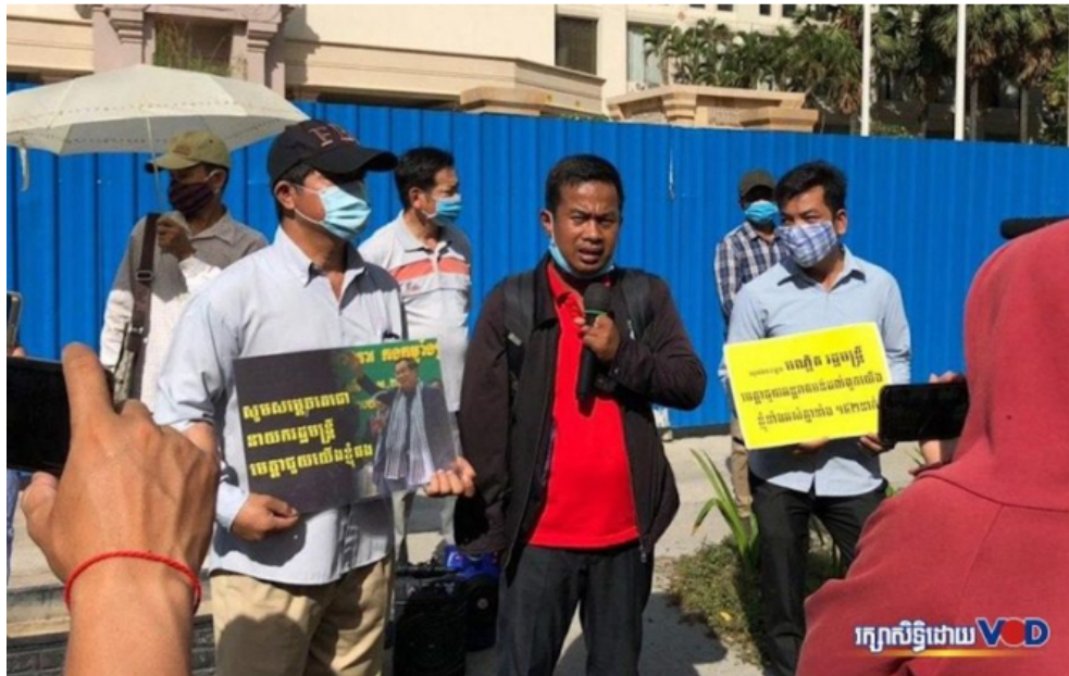
Former employees of The Great Duke Hotel protest in front of the shuttered hotel building in Phnom Penh to demand awarded compensation on May 21, 2020.

[responsivevoice_button voice="US English Female"]