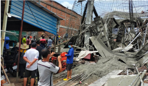
The site of the building collapse in Banteay Meanchey province.

Click here to get Khmer Times Breaking News direct into your Telegram