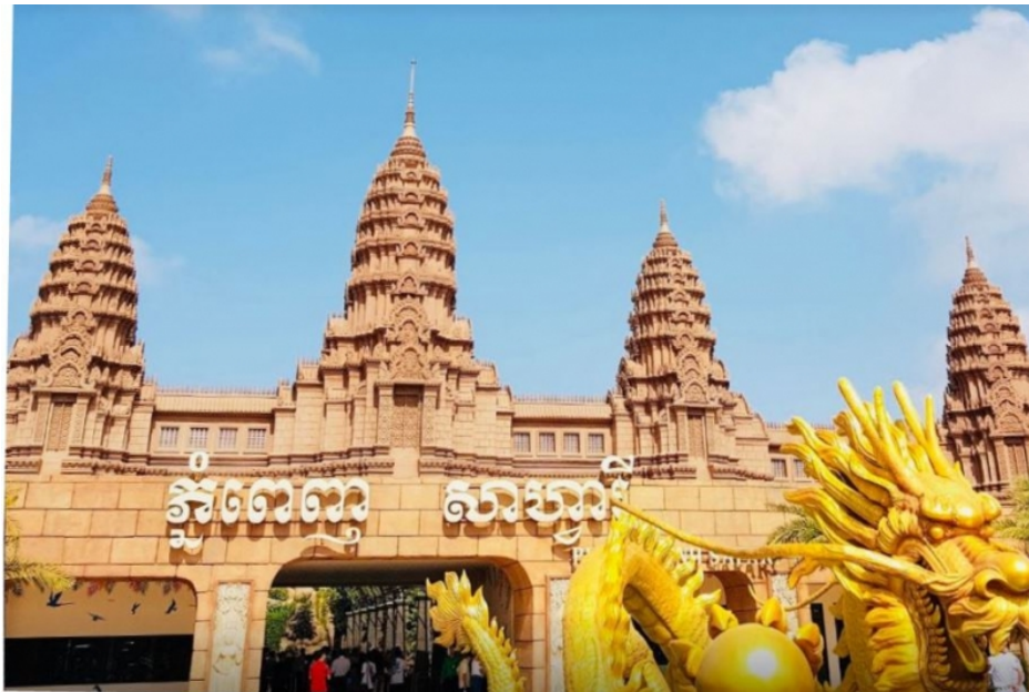
- Video Advertisement -

*The price subject to change depending on the policy of Phnom Penh Safari