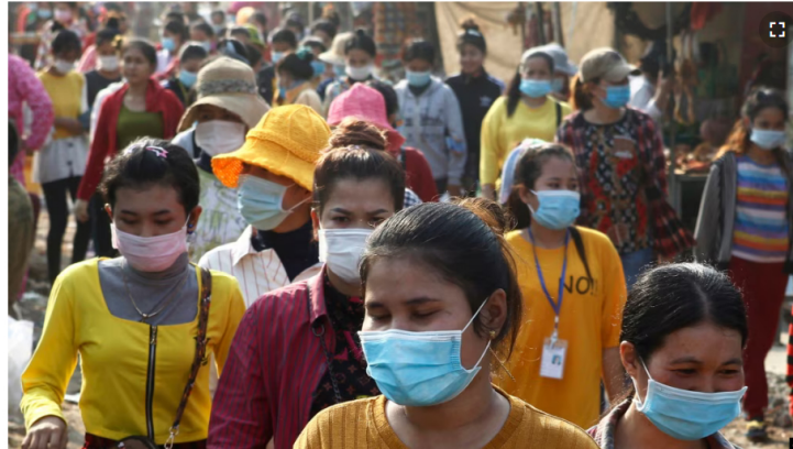
Garment factory workers wear face masks as they finish their work shift near Phnom Penh, Cambodia, Friday, Feb. 26, 2021.

PHNOM PENH, CAMBODIA — Union leaders said they were concerned about workers' safety after one garment factory worker tested positive for COVID-19 on Tuesday, as part of a growing cluster that has registered close to 400 cases so far.