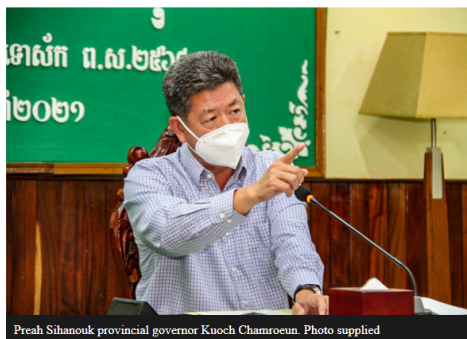
Preah Sihanouk provincial governor Kuoch Chamroeun.

NATIONAL Publication date 29 April 2021 | 15:13 ICT Reporter : Voun Dara More Topic