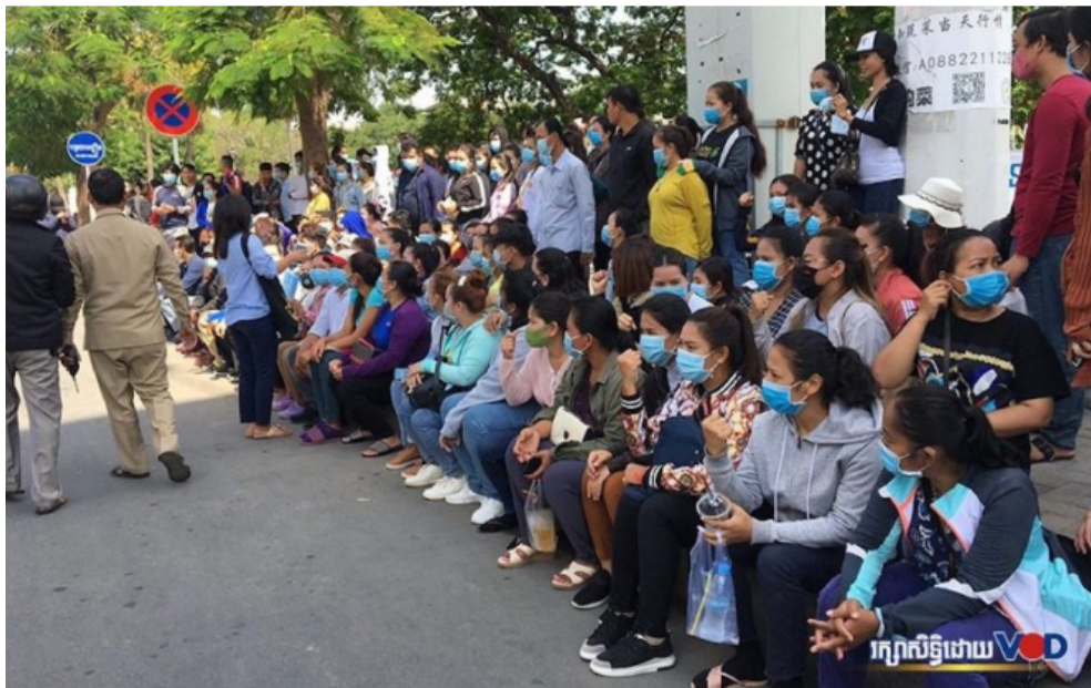
NagaWorld employees gather at the Labor Ministry in Phnom Penh, calling for financial support during work suspensions on June 16, 2020.

Khan Leakhena | Tue Jun 16, 2020 7:37 pm