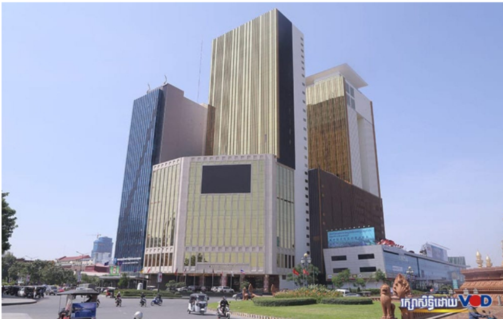
NagaWorld II Casino and Resort in Phnom Penh (VOD)

Sithar said the workers also asked the government to provide them the same $40 per month suspension pay offered to garment workers because the casino workers were still paying taxes to the government.