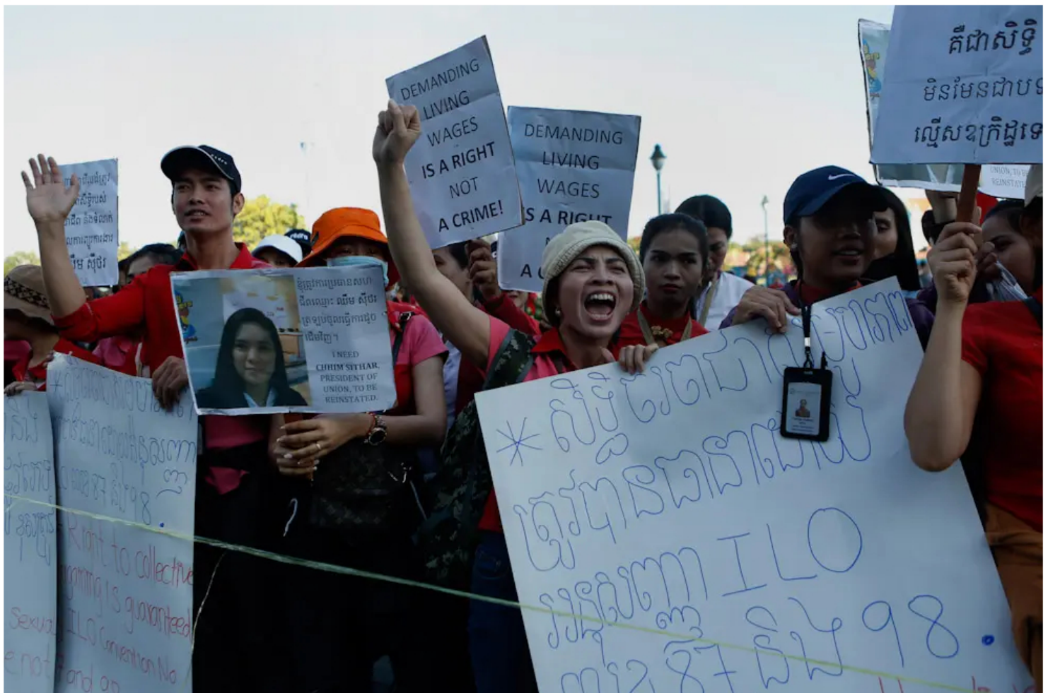
Almost 2,000 NagaWorld workers protested in front of the casino in Phnom Penh on Thursday to demanding the reinstatement of their union representative. Cambodia