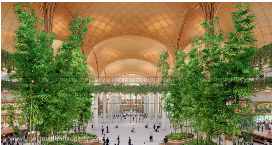
Head House Interior