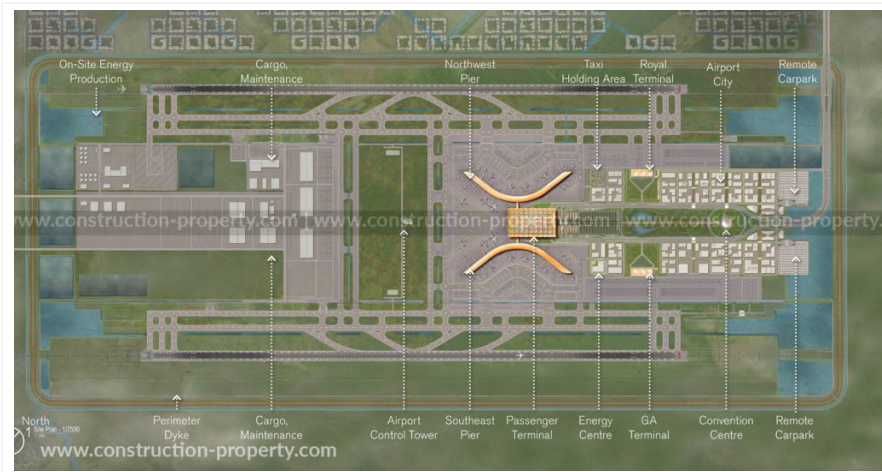
New Phnom Penh International Airport - Masterplan

To date, all these areas are 5% complete so far and are scheduled to be completed by 2022. The drilling foundations of the airport meanwhile are 95% complete.