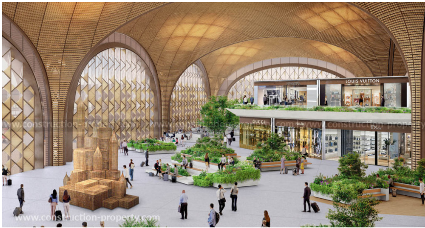
Head House Interior

The new Phnom Penh International Airport is constructed on a 2,600-hectare land plot located in Prek Khiev commune, Kandal Stung district, Kandal province. The project is an investment by the Overseas Cambodia Investment Company (OCIC) and is worth approximately US$1.5 billion. The airport design has been entrusted to Foster & Partners, a renowned international design firm. With the new terminal facilities and a 4F class airport designed, the new Phnom Penh International Airport will become the ninth-largest airport in the world, putting it just behind Chicago O'Hare, and larger than China's Beijing Capital International Airport.