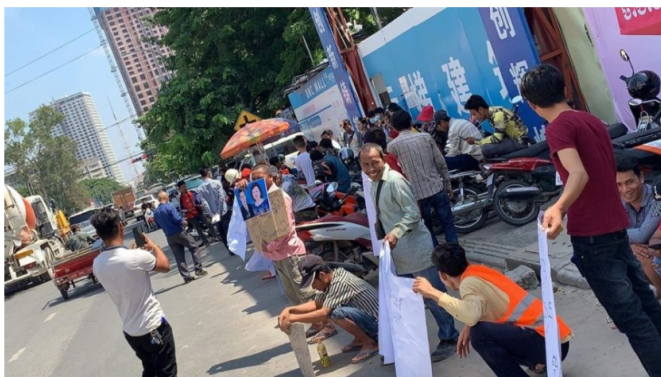
Construction workers protest in front of DNC mall in Phnom Penh's Toul Kork district on October 26, 2020.

[responsivevoice_button voice="US English Female"]