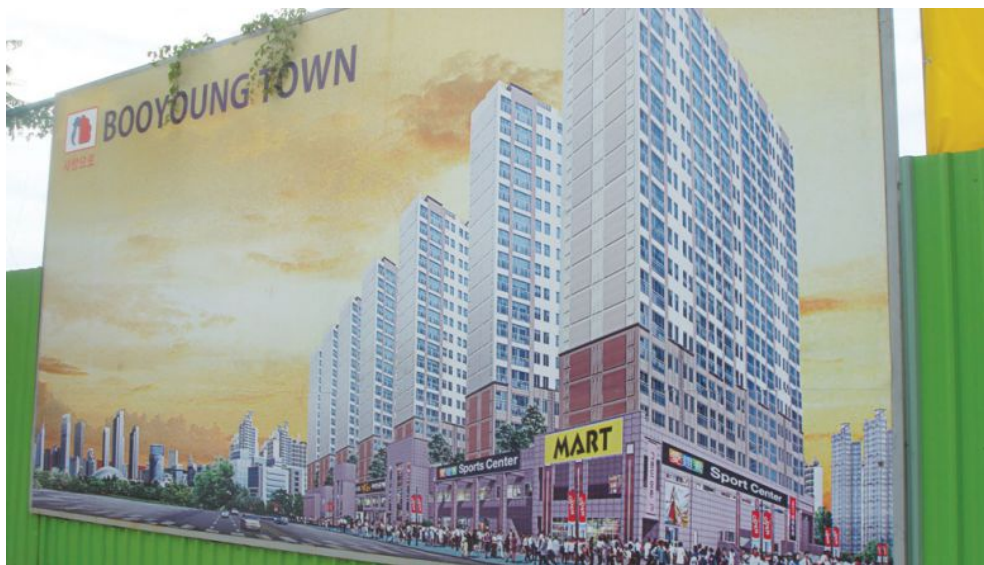
A view of the Booyoung Town project on a billboard in Phnom Penh.

The plan to build the US$1.1 billion Booyoung Town commercial city and housing estate on Russian Federation Blvd near the 7 Makara Bridge is moving forward slowly while the political situation remains unclear.