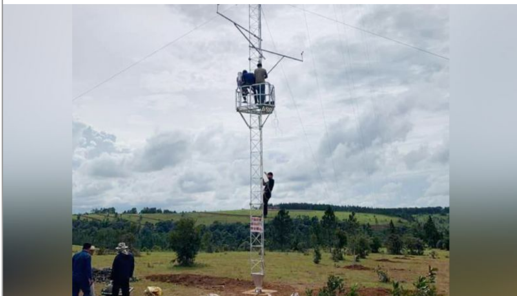
Xinglan Maritime Energy Co Ltd's (XME) $200 million 100MW onshore wind power project in Mondulkiri province has passed its feasibility study.

Xinglan Maritime Energy Co Ltd's (XME) $200 million 100MW onshore wind power project in Mondulkiri province has passed its feasibility study, promising a fresh gust of wind to swell the sails of the Kingdom's burgeoning industry, the local Maritime Group said in a press release.