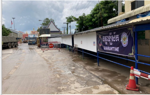
Goods trucks pass a quarantine center to cross the Thai border into Cambodia at Poipet.

[responsivevoice_button voice="US English Female"] A man returning from Thailand and about to be taken into Covid-19 quarantine slipped and hit his head while peeing, had two beers, then died in hospital on Monday, the second quarantine- and head trauma-related death announced by authorities over the past year.