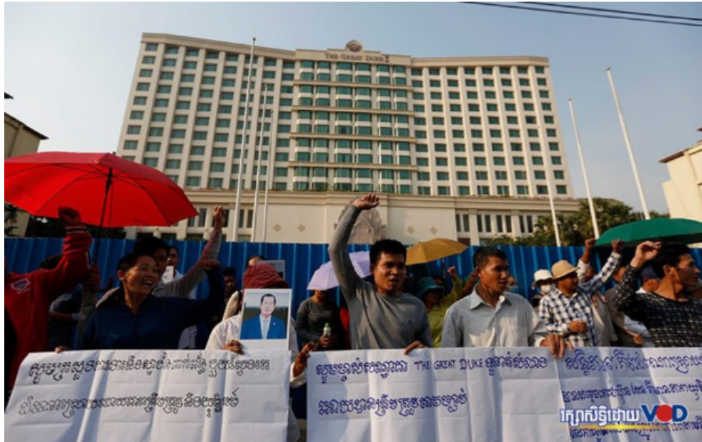
The Great Duke's employees protest in front of the hotel on January 20, 2020. (Panha Chhorpoan) The Great Duke's employees protest in front of the hotel on January 20, 2020. (Panha Chhorpoan)

[responsivevoice_button voice="US English Female"]