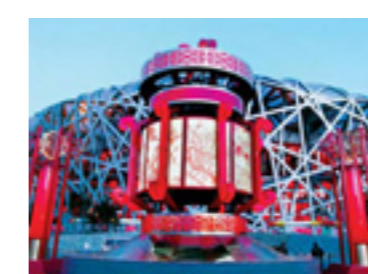
Olympic venues could be 'white elephants' without more revenue