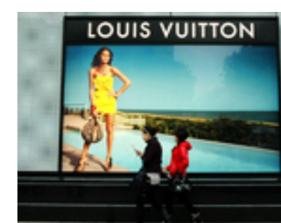
In love with luxury amid global gloom