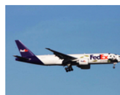
Chinese pandas arrive in Paris