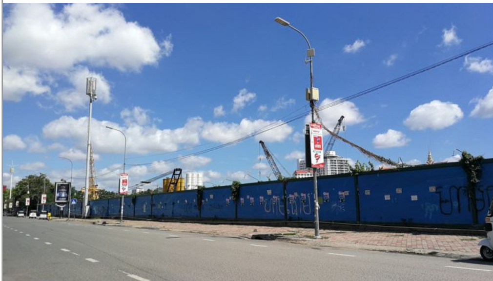
A wall has been built around the perimeter of the Thai Boon Roong Twin Tower project.

The start of construction on the more than $3 billion and over 500m tall Thai Boon Roong Twin Tower has yet to be decided since its initial announcement in 2016, the project manager said.