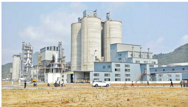
Chip Mong Insee's $262 million cement factory in Kampot province has a production capacity of 5,000 tonnes of cement a day. photo byline is csp, din light, 6pt, kerning -25

Chip Mong Insee Cement Corporation (CMIC) launched a new factory in Kampot province yesterday, with a total production capacity of 5,000 tonnes of cement per day.