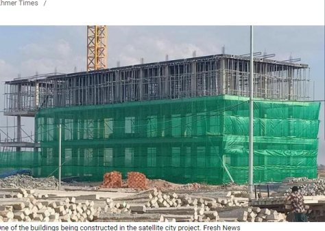
One of the buildings being constructed in the satellite city project.