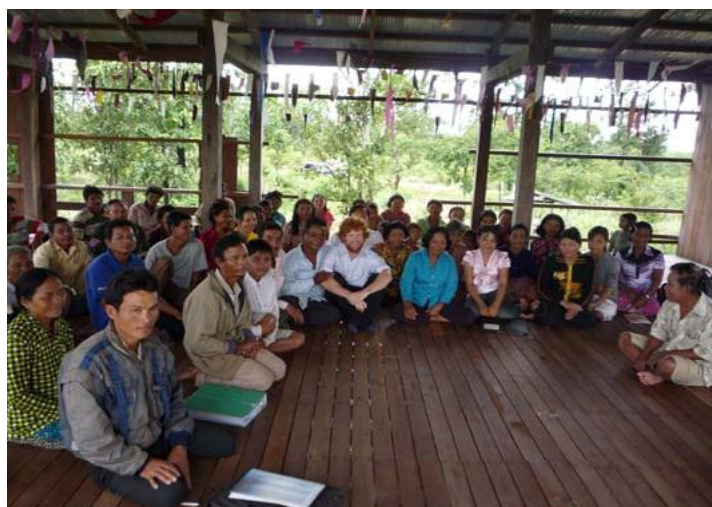
Stieng community in Ksach Lao, Kratie discusses land rights

TWGs are supposed to coordinate meetings and develop action plans for poverty reduction, particularly among indigenous peoples' communities and/or rural poor people. Poverty is also linked to the lack of access to information and the lack of understanding of modern legal instruments (i.e. Land Law, Forest Law, Sub-decree for Land Registration, NPDIP); these undermine indigenous peoples' customary law and practices, and restrict their access to ancestral domain and livelihoods.