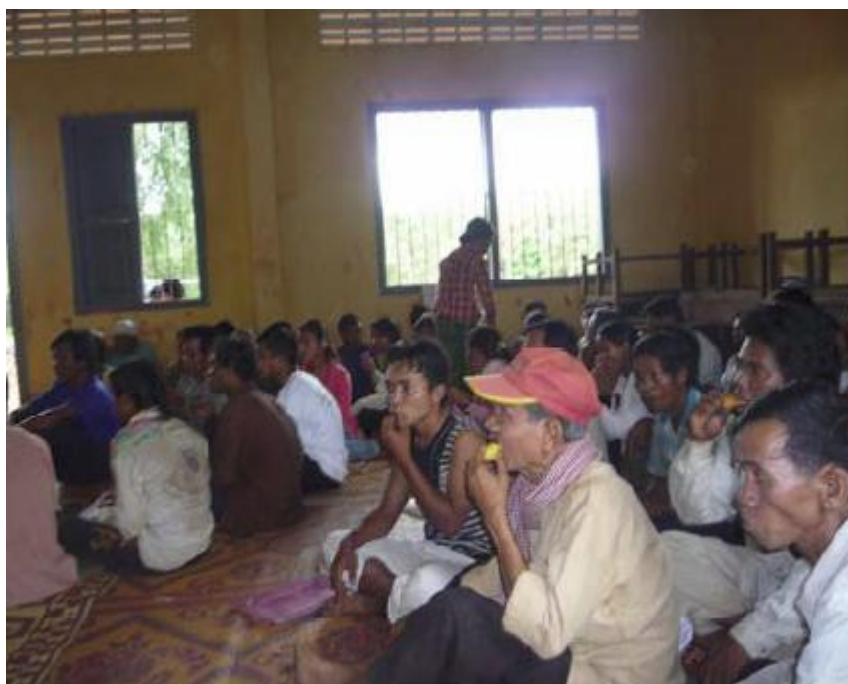
Community leaders attend a workshop to develop their strategic plan for 2010 in O'Yadoa, Ratanakiri.

A mechanism for NGOs' and indigenous organizations' operations should be included when planning a Commune Investment Programme (CIP) process. For instance, WWF and WCS developed methods on community participation in the CIP process for a pilot stage at Mondulkiri province. The pilot can be expanded into other target provinces. The established indigenous peoples or Natural Resource Management (NRM) communities are to be invited by the Commune Council to join the Commune Planning and Budgeting Committee so that they can integrate their problems and needs into the CIP process. A report by ILO on Including Indigenous Peoples in National Strategic Development Plan in Cambodia 19 also recognized that indigenous community participation in the CIP process is necessary to mobilize support from government agencies, NGOs and the private sector, including humanitarians. The report also proposed to insure the implementation of existing provisions for registering and titling indigenous peoples' communities and lands and to adequately reflect indigenous peoples' needs and priorities in the CIP. Awareness raising, training, and capacity-building should be undertaken at a subnational level.