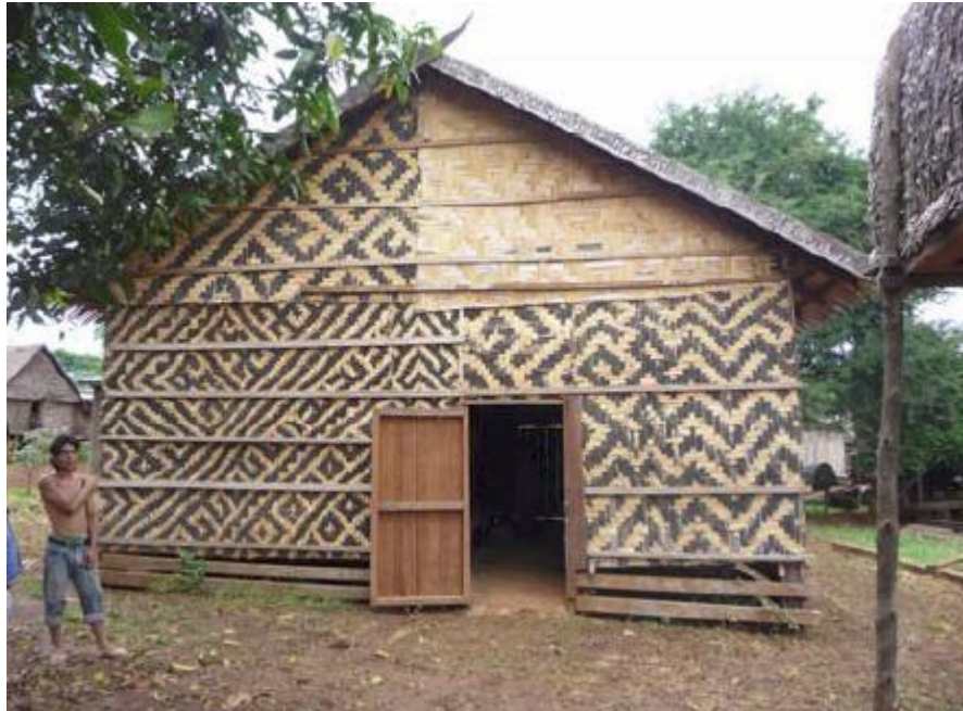
Culture Centre of Kreung Community in Teun, Ratanakiri

Representatives of indigenous groups from south-western and north-eastern provinces of Cambodia, who spoke during the commemoration of International Day of the World's Indigenous Peoples in 2006 in Cambodia 8 , indicated that they have similar cultural practices. Their livelihoods are based on animal husbandry and rotational (shifting) cultivation, and they are living in strong unity. Apart from rice cultivation, they collect non-timber forest products from the natural forest (i.e. chopping rattan and plucking vine, tapping resin, picking cardamom, searching for quintessence of the Kreusna tree), and weaving, which are the main sources of their families' income. Their customary law and practices have been respected, including taboos on certain animals, trees, secret areas and cemetery sites. They also know how to talk to wind, tree and water spirits to bring blessings of good health and high-yielding crops (Seng Sovathana 2004).