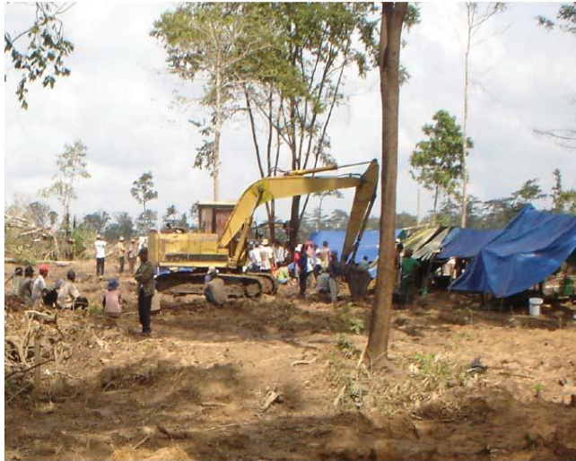
Village residents were surprised in July 2008 when they found their farmland in Savoul district was being cleared for a rubber plantation they knew nothing about. They protested and company workers dismantled the site. The case is now at the provincial criminal court.

Now he lives in fear of arrest or murder over a land dispute that is becoming increasingly frightening to him and his family.