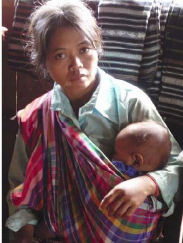
Poor family in Kanh Chheurng Community, Ratanakiri

There is no political platform for indigenous leaders and representatives to be engaged at local and national levels. This is true, despite the fact that there are 18 Technical Work Groups (TWGs) on land, forestry and environment, planning and poverty reduction that were set up in 2004 as mechanisms for government-donor collaboration (see Annex 3).