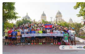
Sponsor of the KKRC 2024 London Marathon organized by KK Running Club