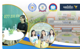
Sponsor of the employment forum and workshop on "Preparing for a career in the Digital Era" organized by the Ministry of Labour and Vocational Training and ACLEDA University of Business on February 20, 2024