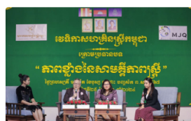
Sponsor to the Cambodia Women Entrepreneurs Associations (CWEA) to support their program "The Strength of Women's Unity" on January 25, 2024.