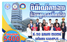
Sponsor the 2024 Job Fair and Career Guide organized by the Ministry of Labour and Vocational Training