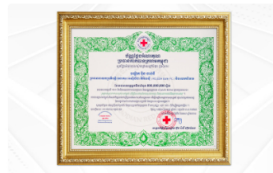
Donation KHR 800,000,000 to the Cambodian Red Cross on their 161st anniversary of World Red Cross Day on May 8, 2024.