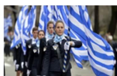
193rd Greek Independence Day Parade held New York