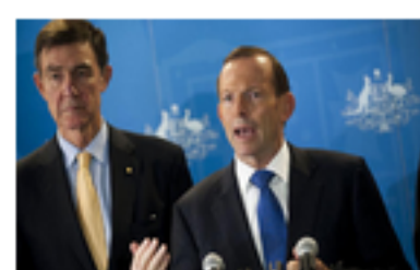
Australia vows to press ahead with MH370 search