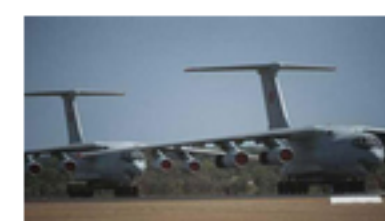
Chinese air search operation in southern Indian Ocean begins