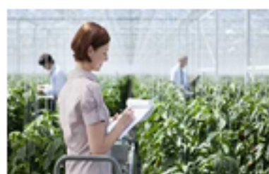
Britain to boost agricultural innovation among universities, farms