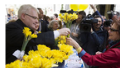
Daffodil Day event organised in Croatia for breast cancer sufferers