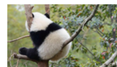
Panda cubs at Chengdu Research Base in SW China