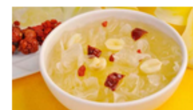
Healthy food for smoggy weather