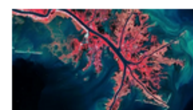
ESA unveils amazing satellite photos of earth