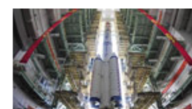
Shenzhou-10's docking mission with Tiangong-1