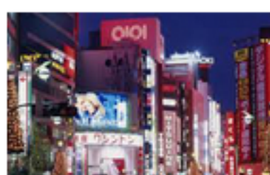
Japan's industrial output drops for 1st time in 3 months