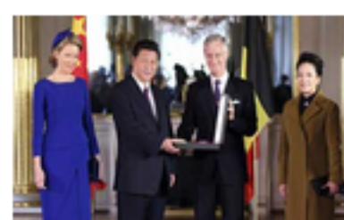
Xi expects his visit to boost China's ties with Belgium, Europe