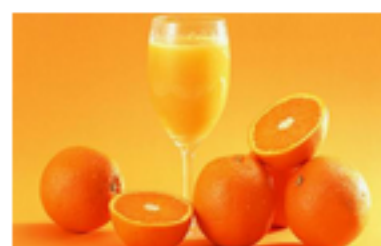
25 healthy foods to keep you young