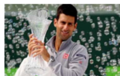
Djokovic beats Nadal to lift 4th Miami title