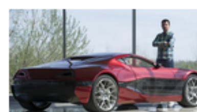
In pictures: fastest electric vehicle