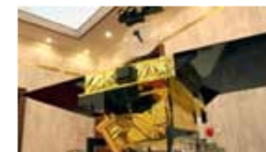
China launches lunar probe Chang'e-3